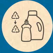
Plastic Containers (look on bottom for #1 -7)