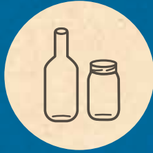
Glass and Jars