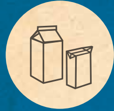
Milk & Drink Cartons