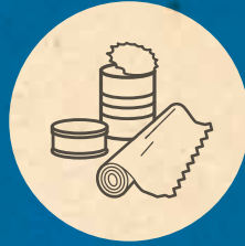
Aluminum Foil, Trays, Pie Plates and Tin Cans